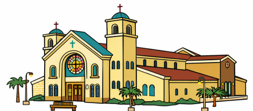
St. Joseph Catholic Church